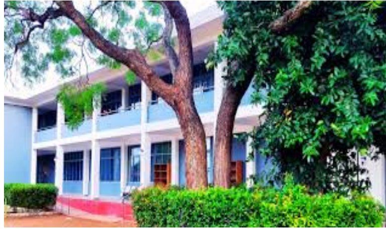
Figure 1.2: Faculty of Technological Studies, University of Vavuniya