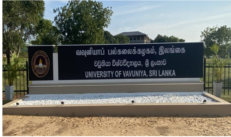
Figure 1.1: The University of Vavuniya, Sri Lanka

The Faculty of Technological Studies of the University of Vavuniya consists of one Department, namely Department of Information and Communication Technology.